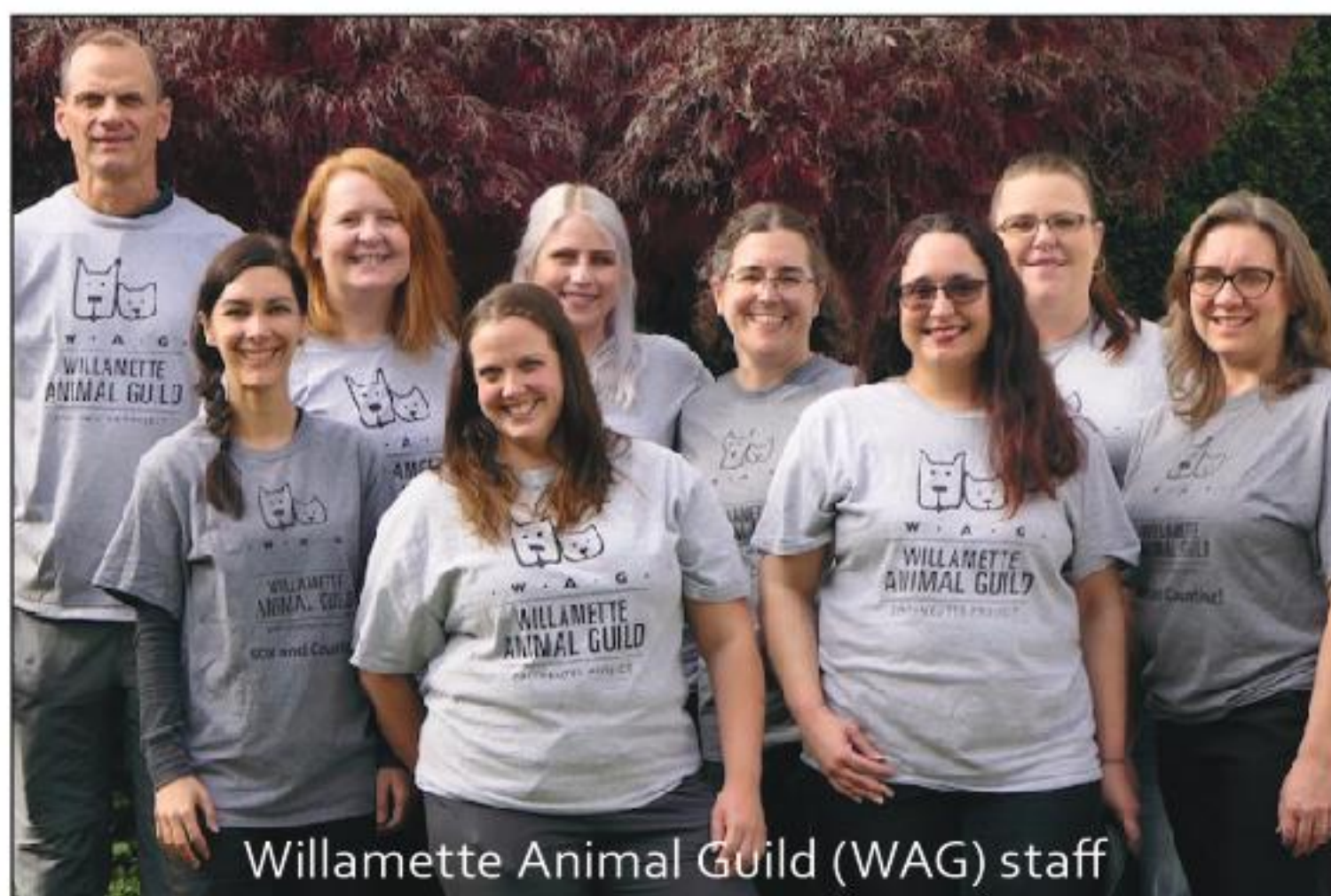
Willamette Animal Guild (WAG) staff

Thanks to Ninkasi Brewery and Viking Braggot Co. for hosting great fundraisers for WAG in 2019!